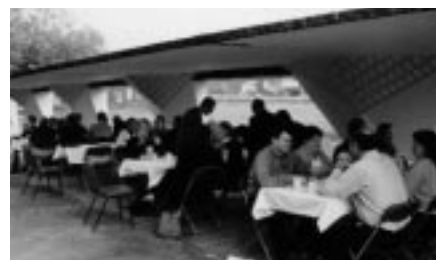
UMHEF Trustees enjoy breakfast on the campus of Florida Southern College before a full day of committee meetings at the board meeting in March.

and effort they expended in hosting our board of trustees.